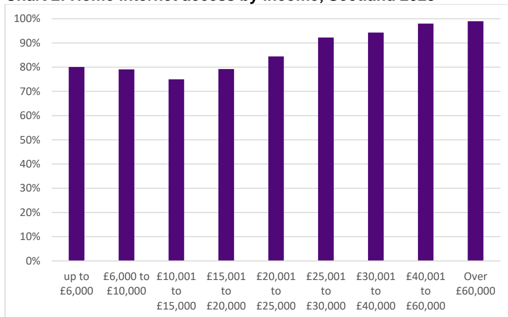
Chart 2: Home internet access by income, Scotland 2023

Those on lower incomes are less likely to have home internet access, with 77% of those under £10,000 having access compared to 100% of those with incomes over £60,000. Chart 2 below shows home internet access by income.