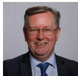
Alexander Stewart Scottish Conservative and Unionist Party