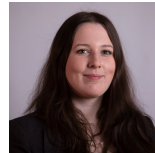
Emma Roddick Scottish National Party