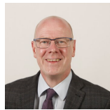
Kevin Stewart Scottish National Party