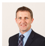
Deputy Convener Michael Matheson Scottish National Party