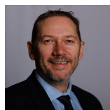
Douglas Lumsden Scottish Conservative and Unionist Party