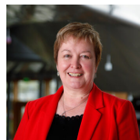
Rhoda Grant Scottish Labour