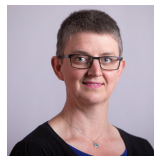
Deputy Convener Maggie Chapman Scottish Green Party