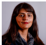
Pam Gosal Scottish Conservative and Unionist Party