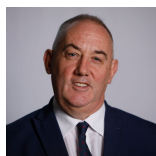
Paul McLennan Scottish National Party