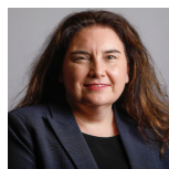
Katy Clark Scottish Labour