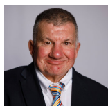
Jeremy Balfour Scottish Conservative and Unionist Party