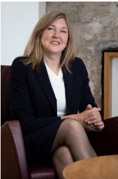
Am Fìor Urr Alison Johnstone BPA

Tha sinn a' toirt taing do gach neach air feadh na h-Alba a chuidich sinn san obair seo agus tha sinn a' coimhead air adhart ri bhith ag obair còmhla ri clann is daoine òga thar na bliadhna a tha romhainn gus an cuideachadh a' gabhail pàirt nar Pàrlamaid agus nar deamocrasaidh.