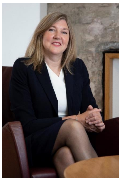
Rt Hon Alison Johnstone MSP

We thank everyone across Scotland who has supported us with this work so far and look forward to working with children and young people over the next year to help them play their part in our Parliament and our democracy.