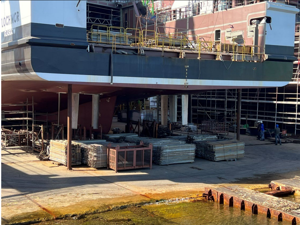
Lochmor - On the Slipway