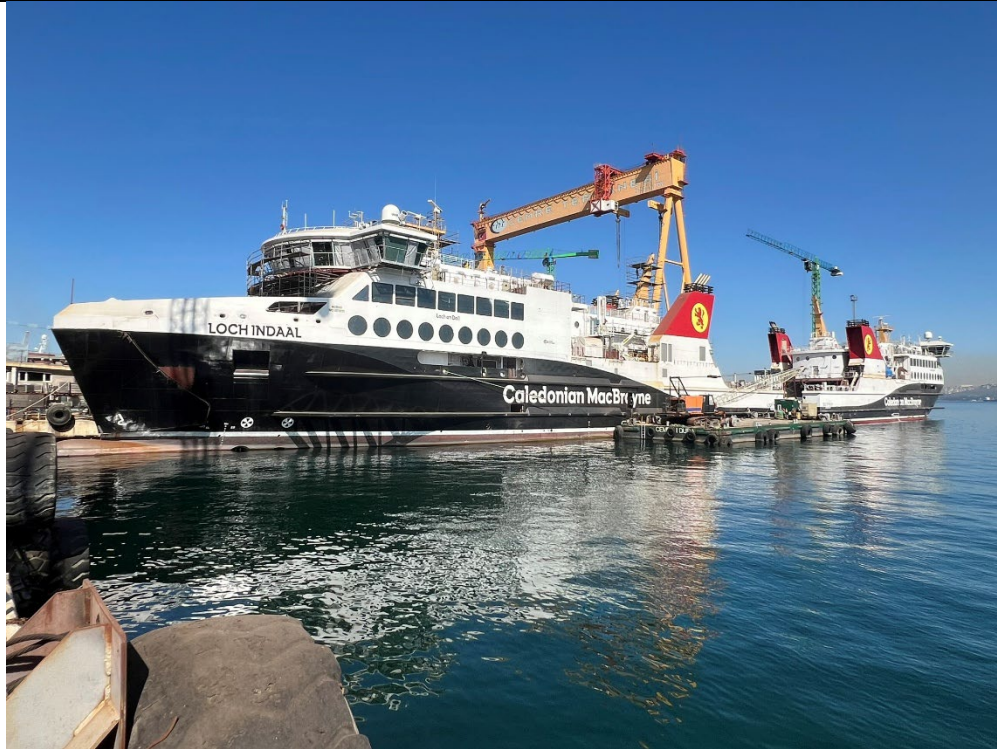
Loch Indaal at Quayside