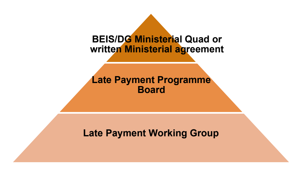
Figure 1: Decision making diagram