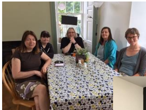
Members of Bridgend Farmhouse Volunteer Forum

The group used the ‘sociocratic’ method to discuss the questions posed by the Citizen Participation