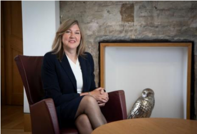
Rt. Hon Alison Johnstone MSP Presiding Officer

Rinn sinn an ro-innleachd àrd-mhiannach seo le co-obraichean thar Seirbheis Phàrlamaideach na h-Alba, a' cleachdadh an eòlais aca air conaltradh le Buill, luchd-obrach is am poball. Tha e a' mineachadh mar a dh'obraicheas sinn san t-Seisean gus ar dealas a choileanadh gus piseach a thoirt air beatha muinntir na h-Alba.